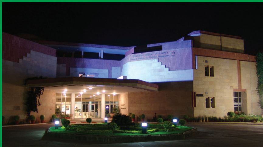
Panoramic night view of IIPM, Gurgaon – the venue of the programme