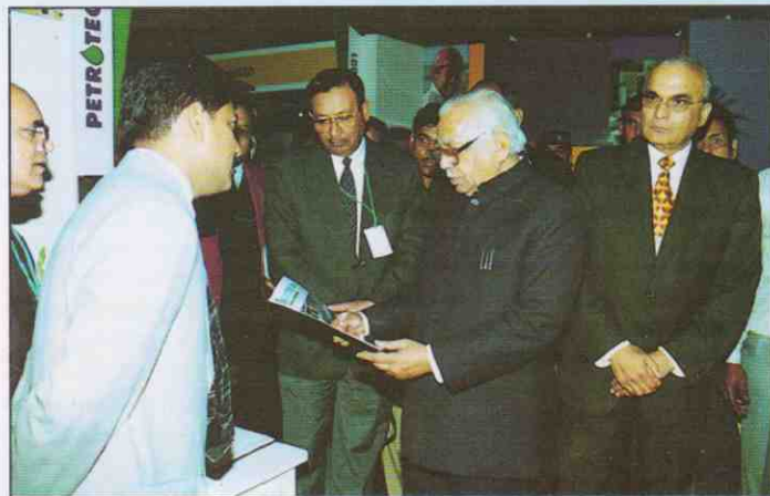
Minister for Petroleum and Natural Gas Shri Ram Naik at TSI Stall during Petrotech-2001. Shri M. A. Pathan, Chairman, IOCL is also seen in the picture.

There were over 200 visitors to this stall during the exhibition. The stall had evinced good response from the visitors to the exhibition which included Hon'ble Minister for Petroleum and Natural Gas, Shri Ram Naik. The minister was happy to note the activities of societies like TSI working in the scientific field.