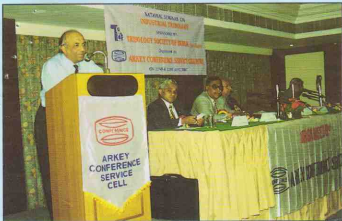
Inauguration of National Seminar on Tribology at Pune