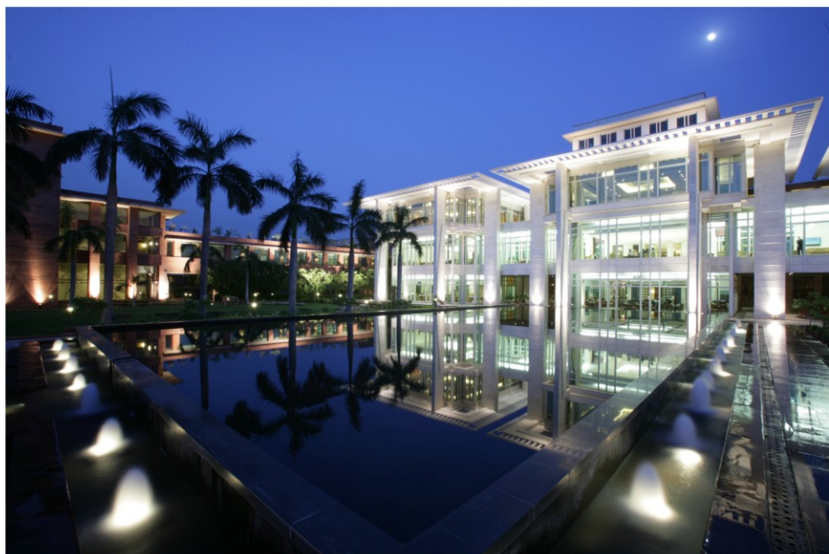
Jaypee Palace Hotel & International Convention Centre, Agra