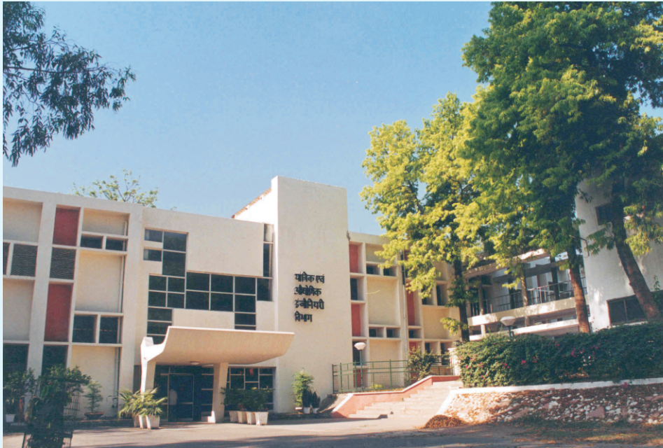
Department of Mechanical & Industrial Engineering, Indian Institute of Technology Roorkee

The Department of Mechanical Engineering came into being in the year 1946 and was renamed as Department of Mechanical & Industrial Engineering on its silver jubilee in 1971. At present it offers undergraduate courses in the area of Mechanical Engineering and Industrial Engineering. The department offers Master of Engineering courses in Machine Design Engineering, Production and Industrial