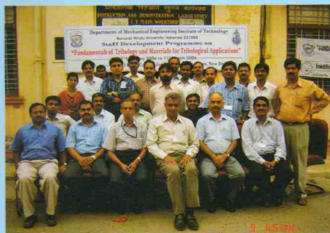
Group Photo of The Participants of The TSI Sponsored Staff Development Programme Held at BHU IT Varanasi

The course was intended to impart the participants the knowledge about fundamentals and current status of tribology and newer materials for tribological applications. About 42 Lectures were delivered from the expertise available at IT-BHU, IITs and various R & D organizations to cover the various aspects of Tribology. One industrial visit to Diesel Locomotive Works, Varanasi was also arranged. The course was successfully conducted for two weeks and participants were happy with course contents. Valedictory function of the course was held on 11th March 2006.